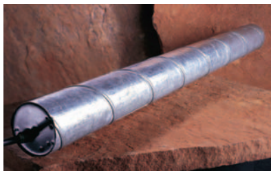
LIDA® Pack Canistered Wire Anode

LIDA® Pack canistered wire anodes are the perfect impressed current anode for shallow vertical and horizontal surface groundbeds, as well as wet, marshy soil conditions where caving is likely to occur.